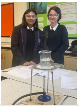
Students with the most Character Points this term

For showing our five character strengths: