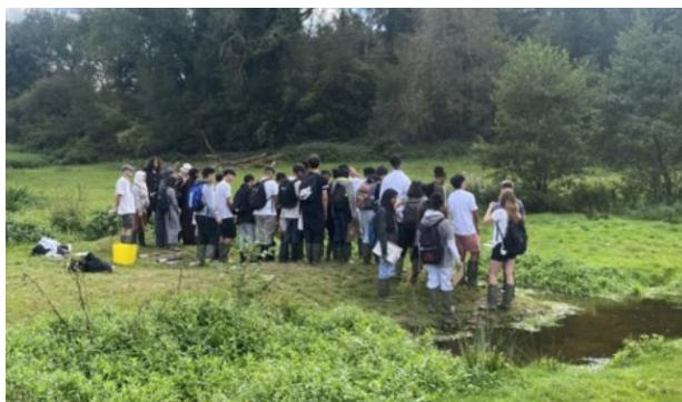
Our Geographers on their Paper 3 field trip.

Year 11 have had a positive start to their exam year, with focused learning in class, intervention sessions up and running, external motivational speakers and trips including Geography and Duke Of Edinburgh!